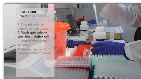
Medicine – Remote Laboratory Management: Respiratory Virus Diagnostics