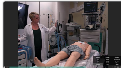
Clinical Skills — Basic Life Support: Cardiopulmonary Resuscitation and Defibrillation